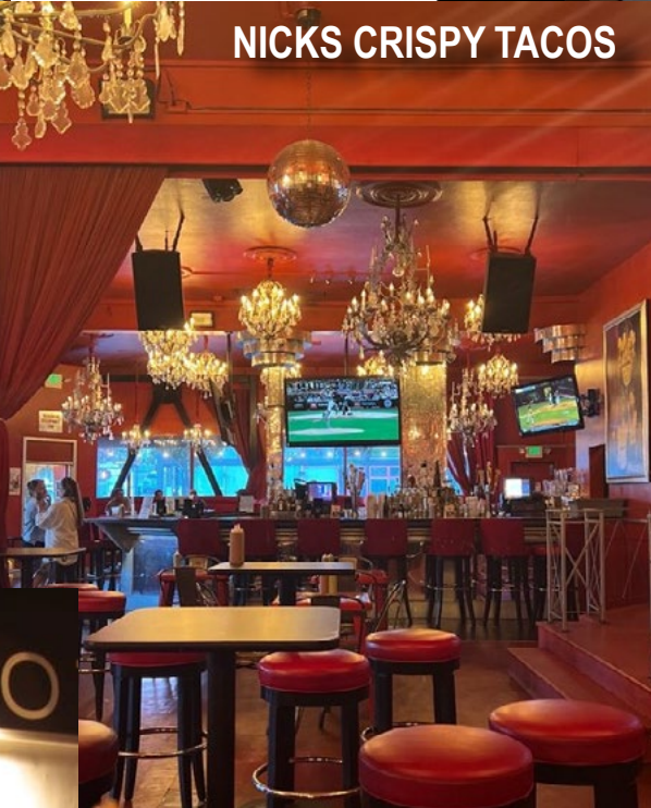
NICKS CRISPY TACOS