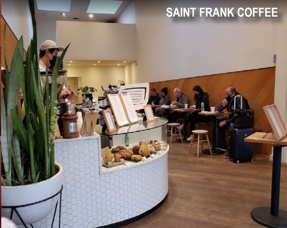
SAINT FRANK COFFEE