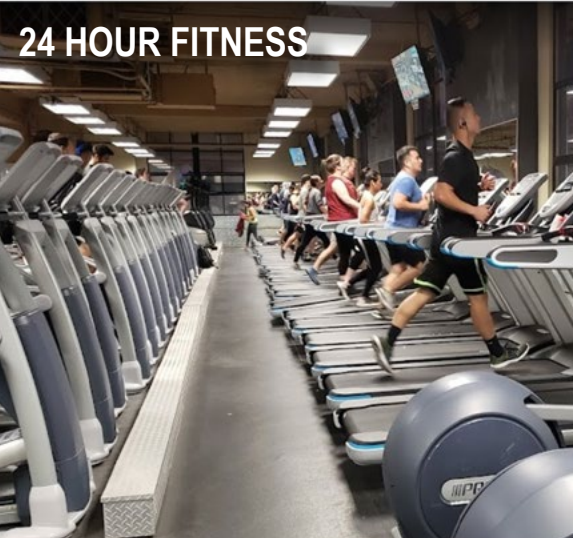
24 HOUR FITNESS